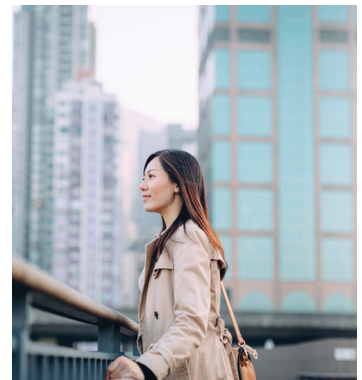
I'm confident about my next step in life.

The bank continues to invest in technology to satisfy the diverse needs of our customer base. As always, we welcome customers into our branches, but we also know that new generations of Cathay customers often approach banking in a manner that fits their lifestyle and unique journeys. And true to our cultural heritage, we expanded our Account Opening Witness Service network, where customers in China can apply to open Cathay Bank accounts, thus broadening our ability to forge new relationships.